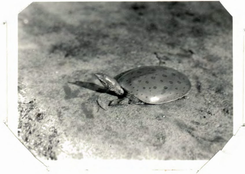
Soft-shelled turtle. Found to feed mostly upon crayfish and aquatic insect larvae ("wigglers"). Along with the snapping turtle, most commonly taken for table use in Michigan.