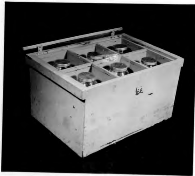
Fig. 3 Glass minnow trap carrying case