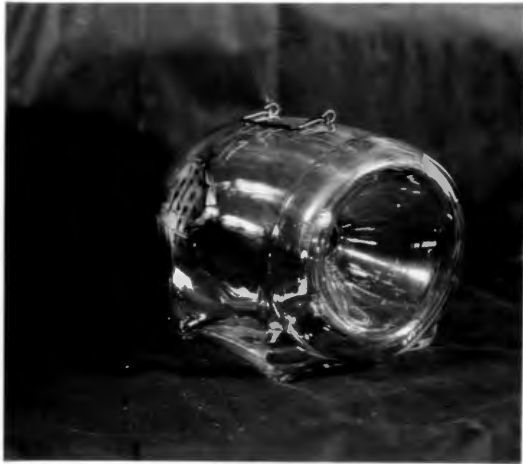
Fig. 1 Round glass minnow trap