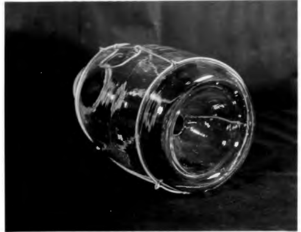
Fig. 2 Flat rest type glass minnow trap