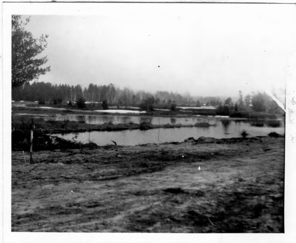
Figure 5.—Photo taken April 8, 1951, showing section C, looking southeast from the north end of fill No. 2.