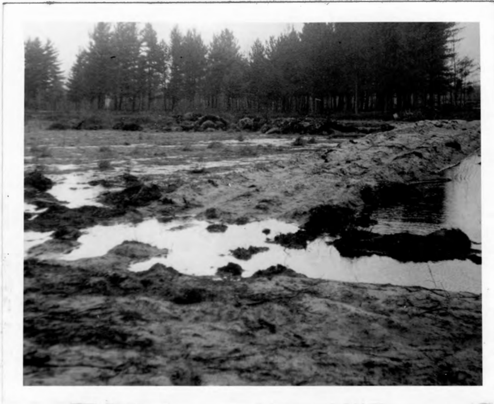
Figure 6.---Photo taken April 15, 1951, looking northwest along fill No. 1. Foreground shows attempt to connect sections A (on left) and B (on right) by ditch at future location of culvert.