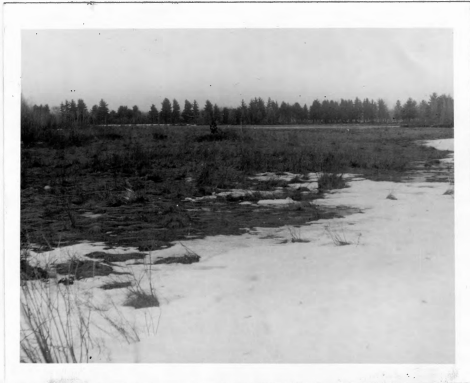
Figure 4.—Photo taken April 8, 1951, showing section B from center of fill No. 1.