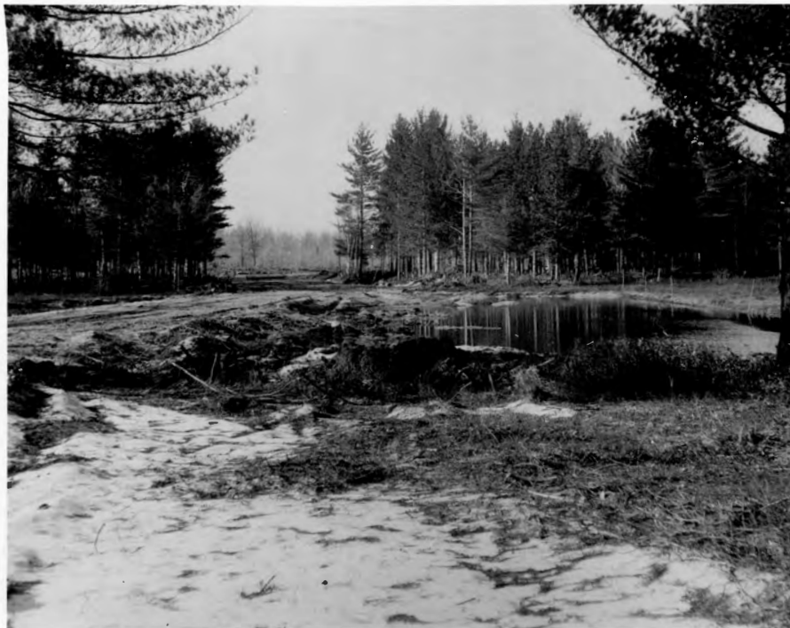
Figure 8.—Photo taken April 26, 1951, showing fill No. 2 (on left) from south end and dredging to its right.