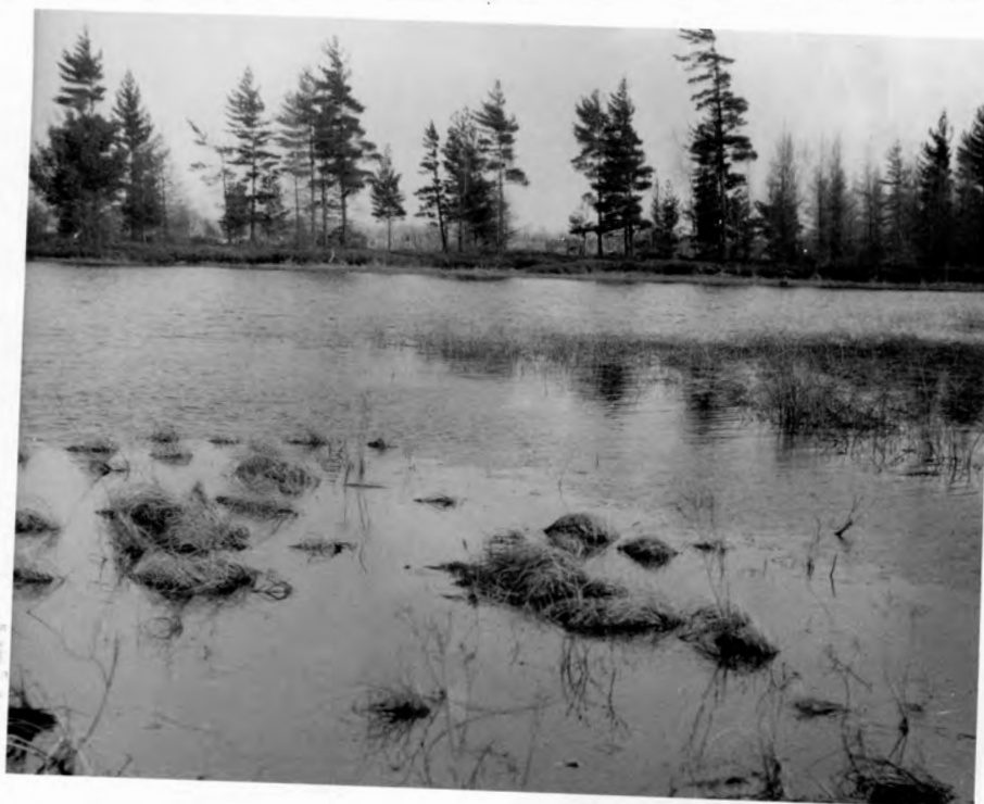
Figure 9.—Photo taken April 27, 1951, looking south across lagoon in section A, showing partly flooded grass in foreground where pike were observed spawning.