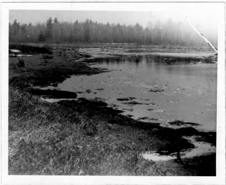
Figure 2.--Photo taken April 8, 1951, looking west along peninsula on left and lagoon on right in section A. (All locations and directions of photos shown on map, Figure 1.)