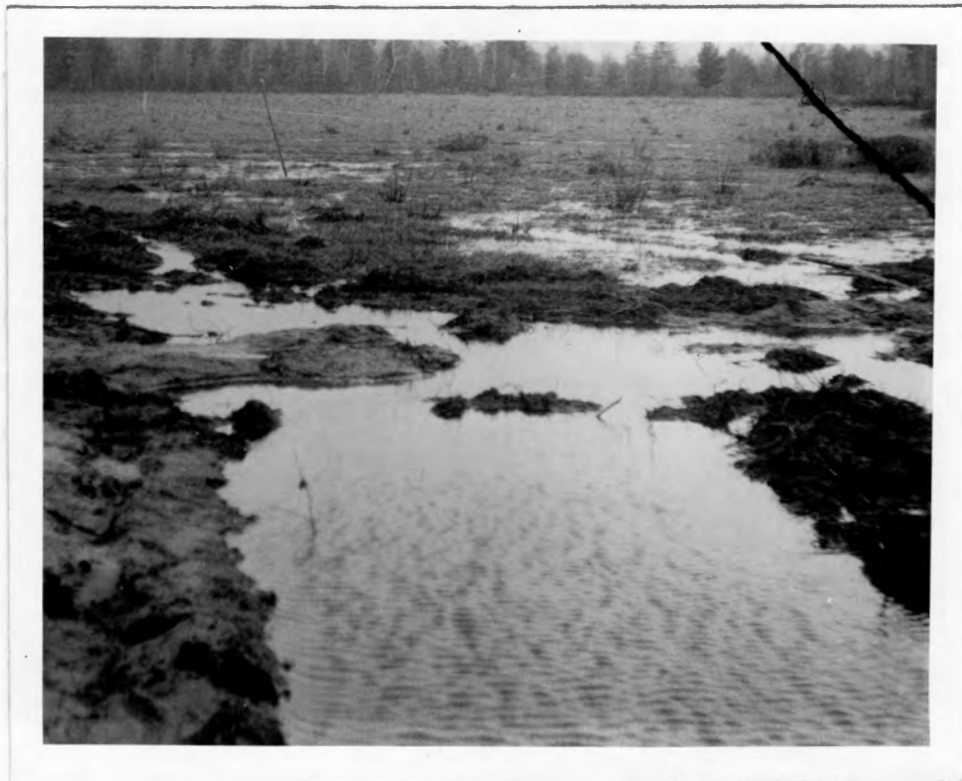
Figure 7.---Photo taken April 15, 1951, looking west across ditch shown in Figure 6, and showing dryness of most of section A. (Lagoon off picture at left.)