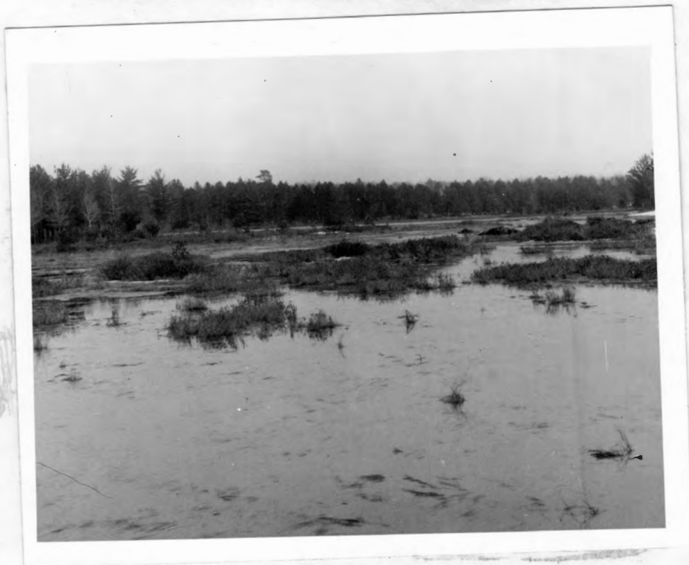
Figure 3.--Photo taken April 8, 1951, looking northeast across section A. Lagoon shows in distance in center background.