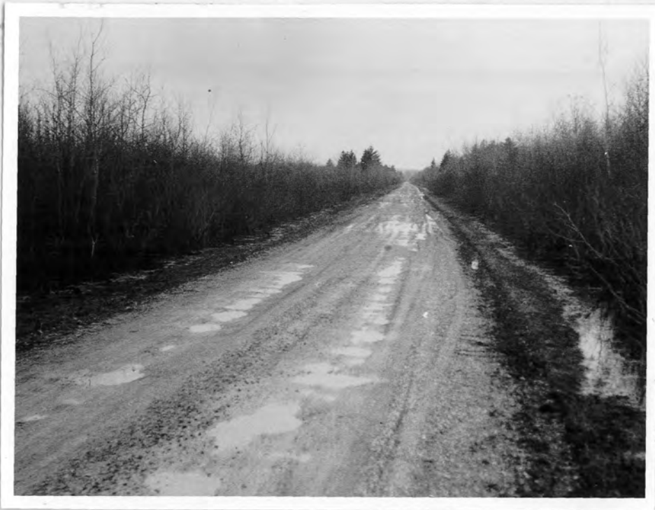
Figure 3. Looking west toward Van (1 1/2 miles) along Van Road. Van Ditch is at the right. April 13, 1951.