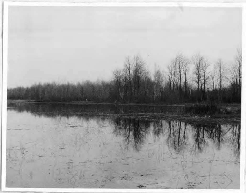
Figure 5. Looking northwest from the point west of the mouth of Lancaster (Bessie) Creek, showing ideal spawning ground typical of much of Marl Bay. April 11, 1951.