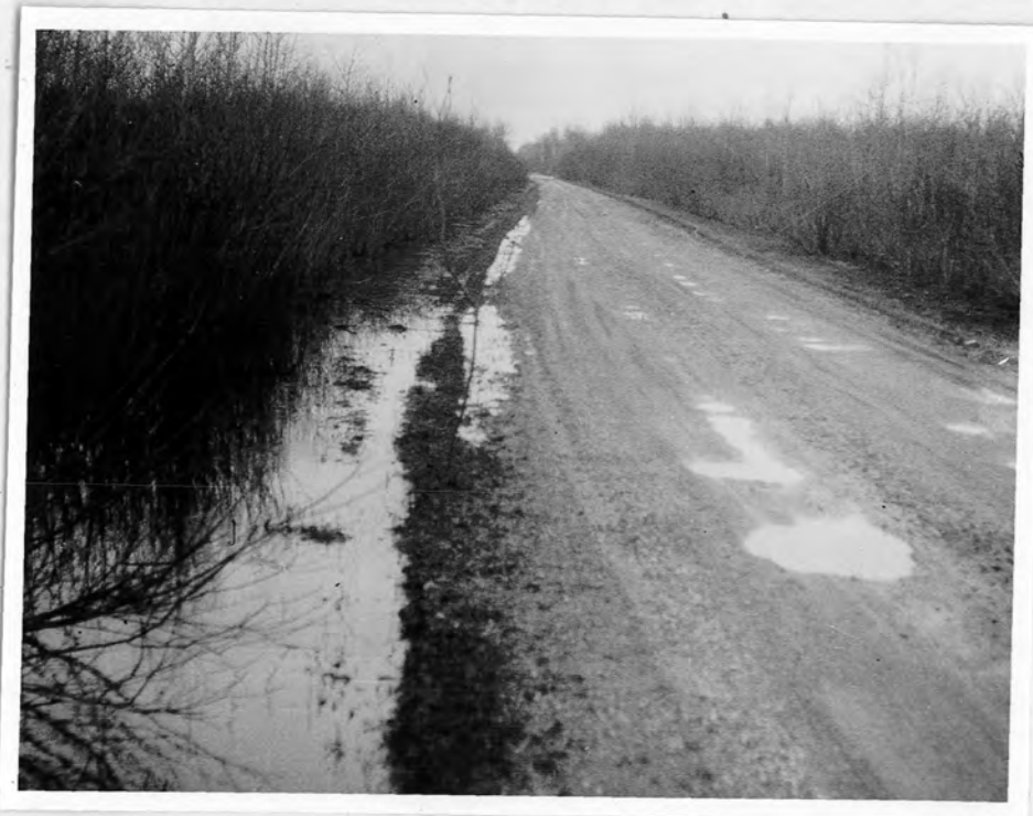
Figure 4. Looking east toward Douglas Lake (one mile) along Van Road. Van Ditch appears at the left. April 13, 1951.