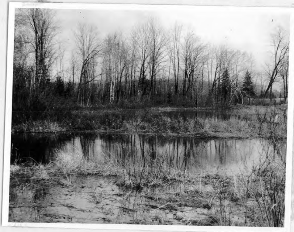
Figure 6. Looking northeast from the western side of the mouth of Lancaster (Bessie) Creek, showing flooded area ideal for pike spawning. The bay in the center background has the same shallow, grassy bottom. April 11, 1951.