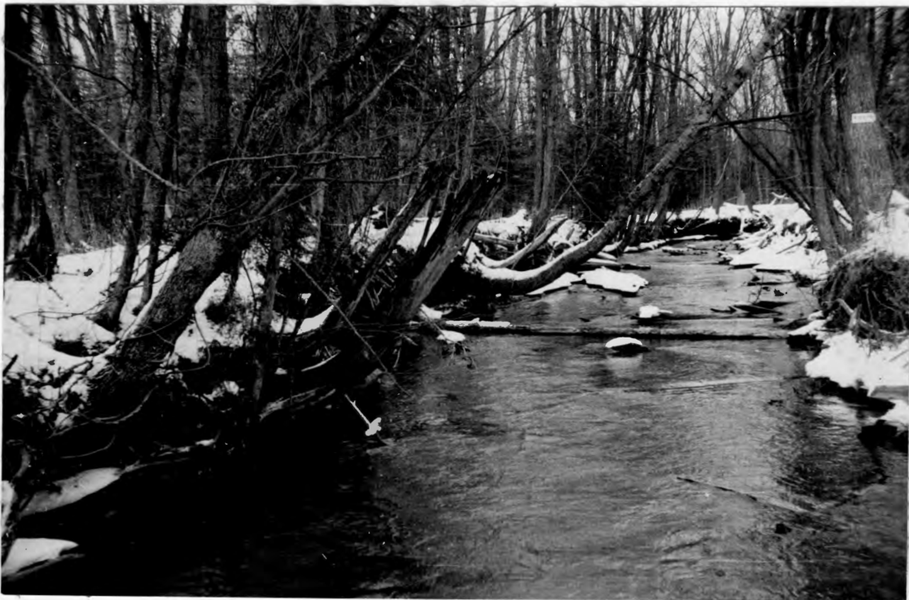
Figure 2. "Middle" Houghton Creek in Section 5, T. 23 N., R. 3 E. showing the undercut bank and obstructions (logs etc.) in the stream (winter of 1950-51).