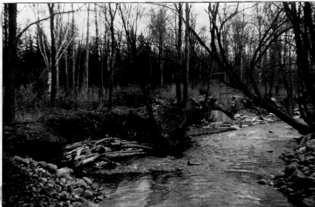
Figure 5. "Middle" Houghton Creek in Section 5, T. 23 N., R. 3 E. A series of jetties on the far bank to prevent undercutting by the current.