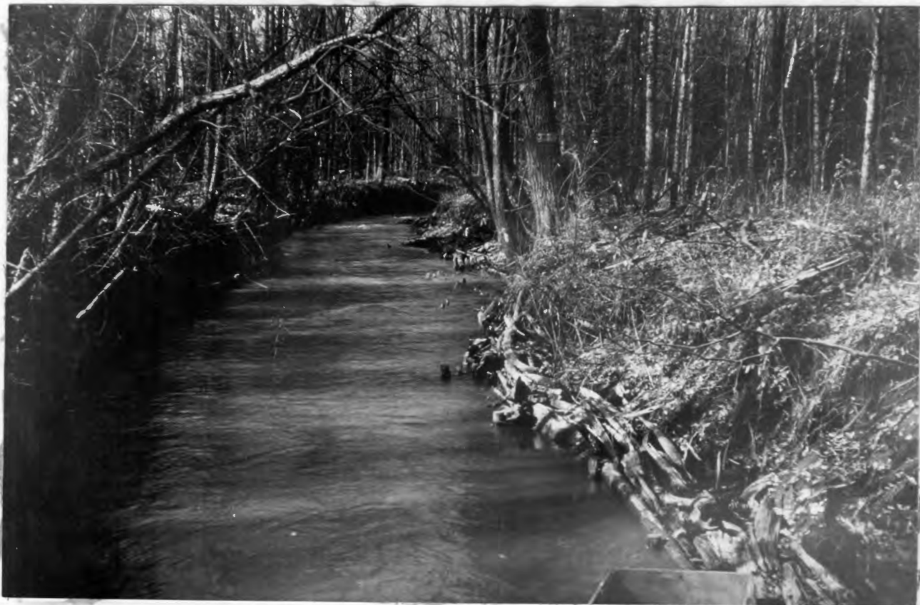
Figure 3. Same section of stream as shown above after it had been "cleaned out" (fall of 1951).