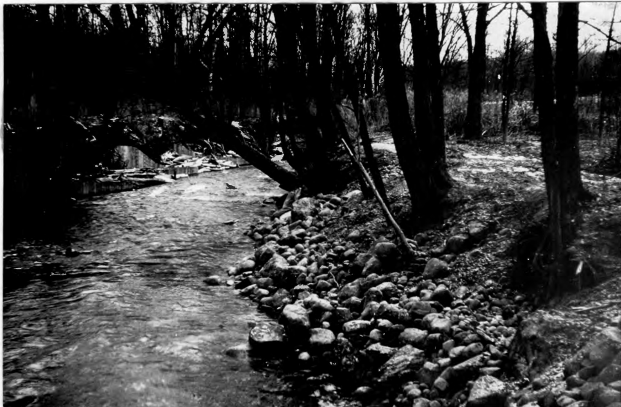
Figure 4. "Middle" Houghton Creek in Section 5, T. 23 N., R. 3 E. Stabilizing bank by filling in with rubble.