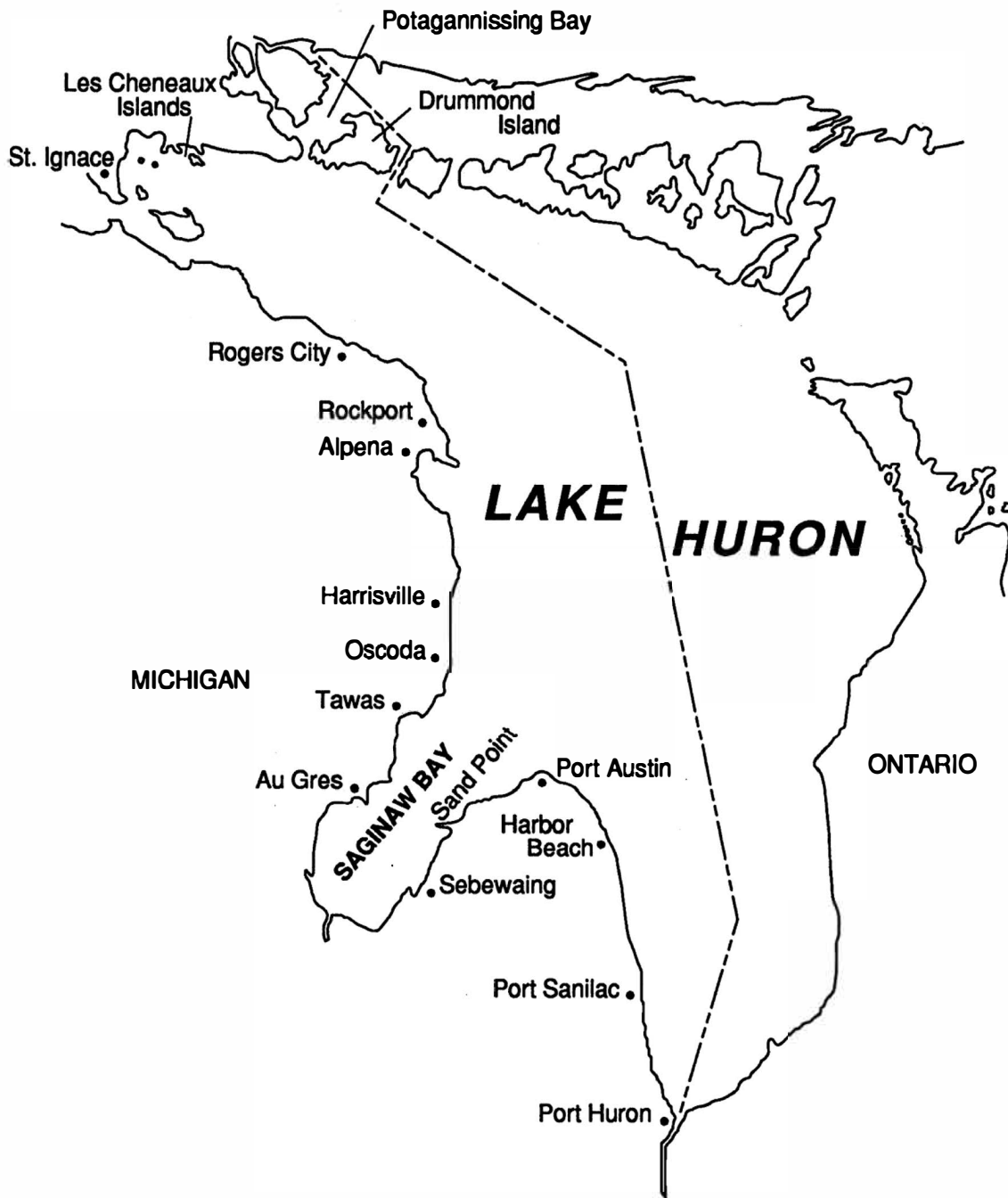
Figure 2.—Lake Huron survey area.