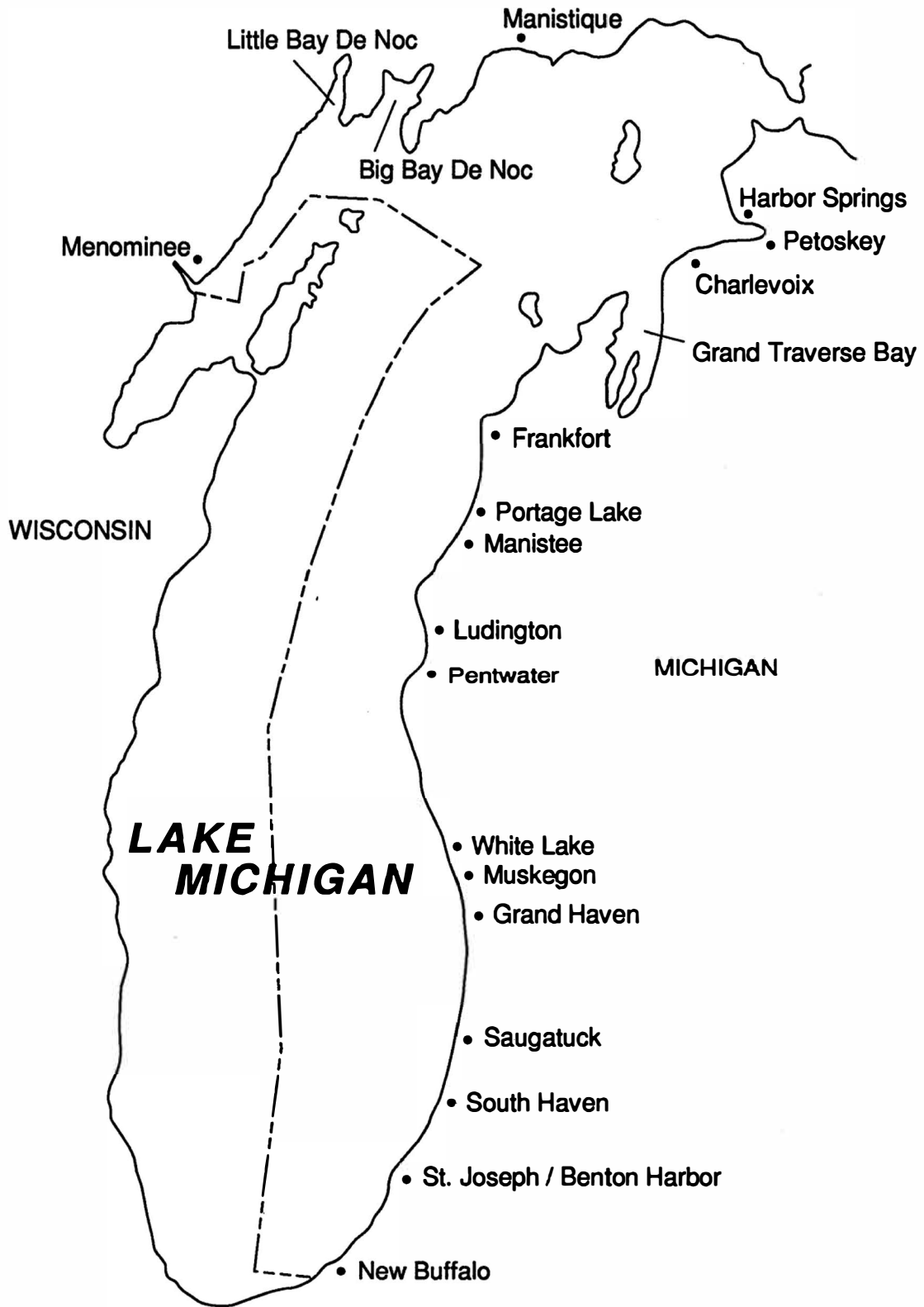
Figure 1.—Lake Michigan survey area.