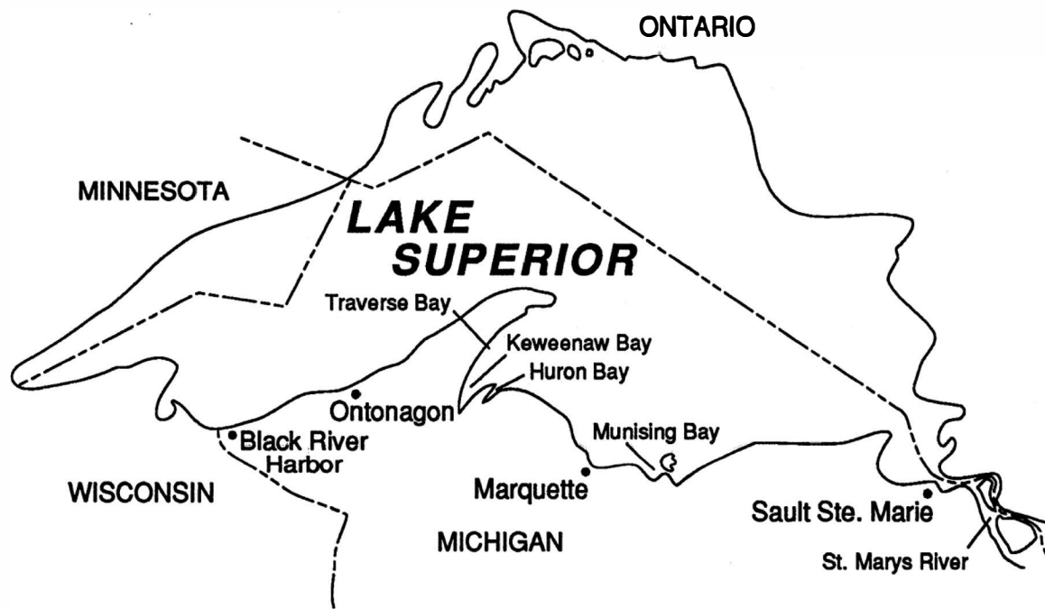
Figure 4.—Lake Superior survey area.