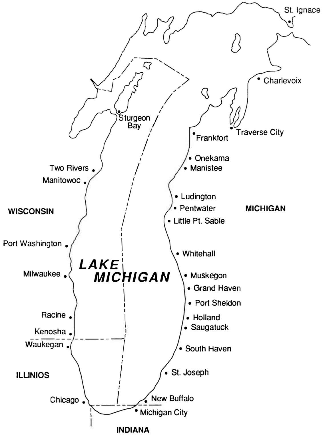
Figure 1.—Map of the affected area of the Lake Michigan chinook salmon mortality, with major ports indicated.