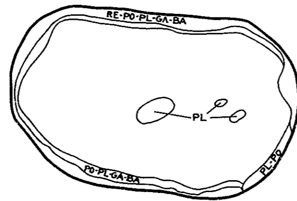
Aquatic Vegetation Map