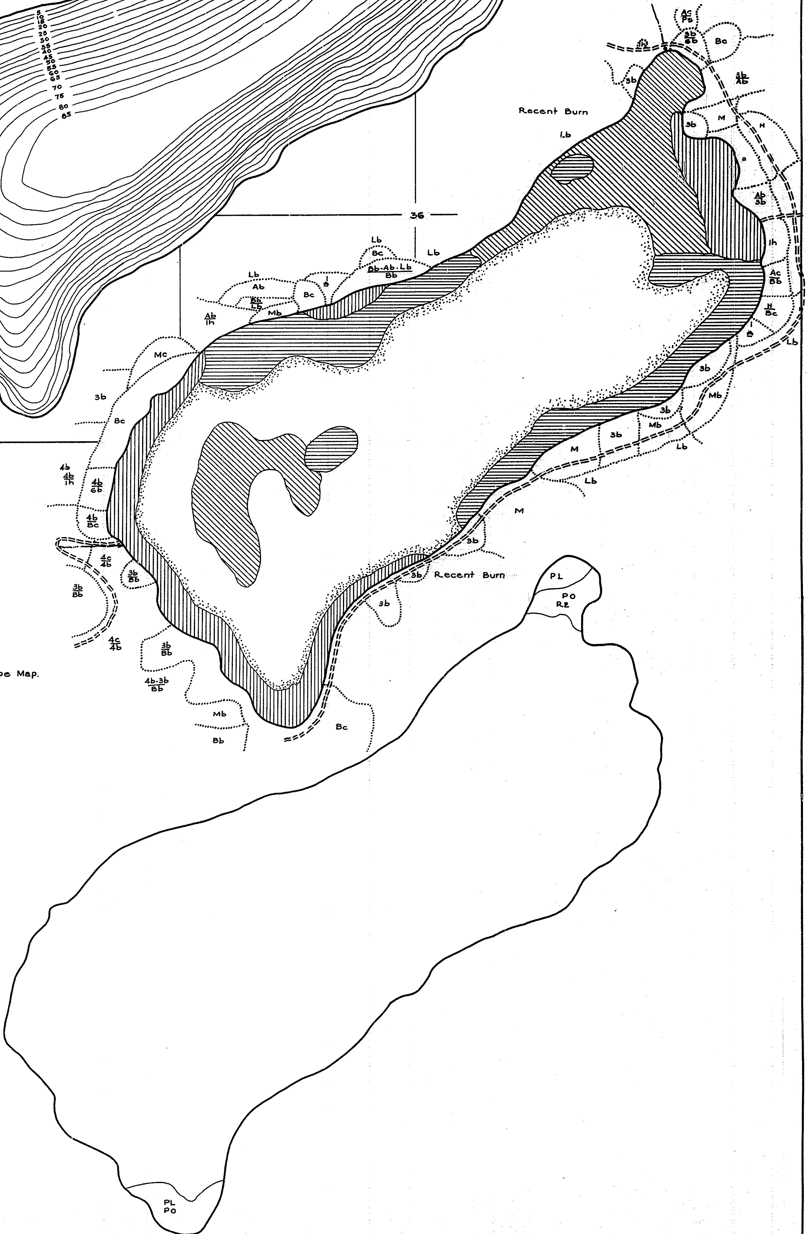
Aquatic Vegetation Map