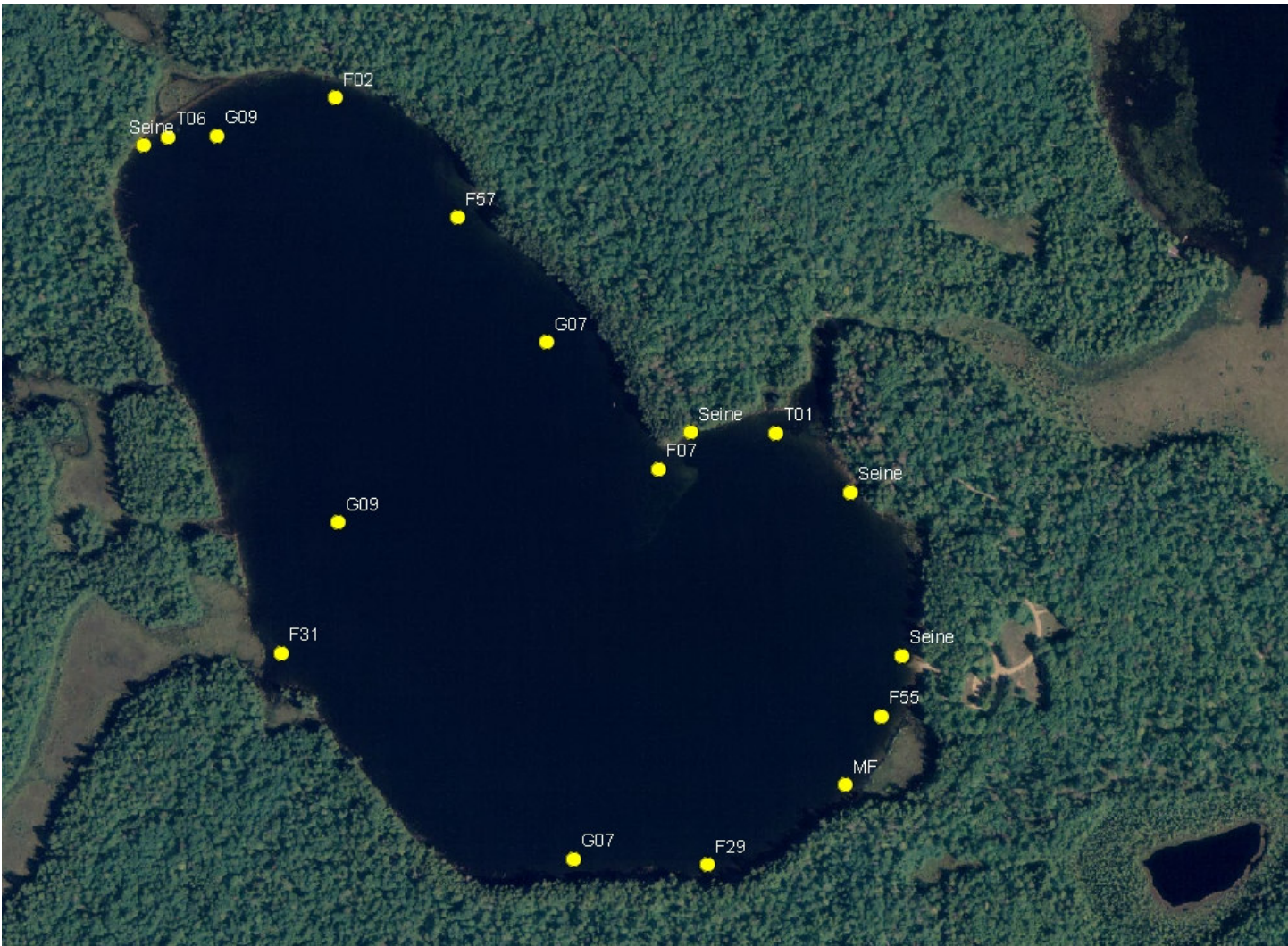
Figure 2. Aerial photograph of Bass Lake, Luce County, showing netting locations during 2008 survey.