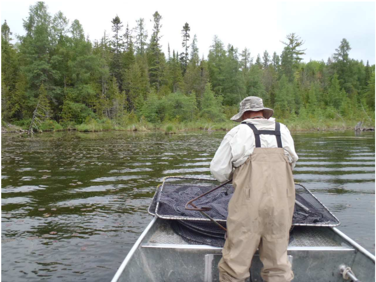
Photo 1. – Chosen net spot Twin Lakes, and a view of the heavily forested shoreline.