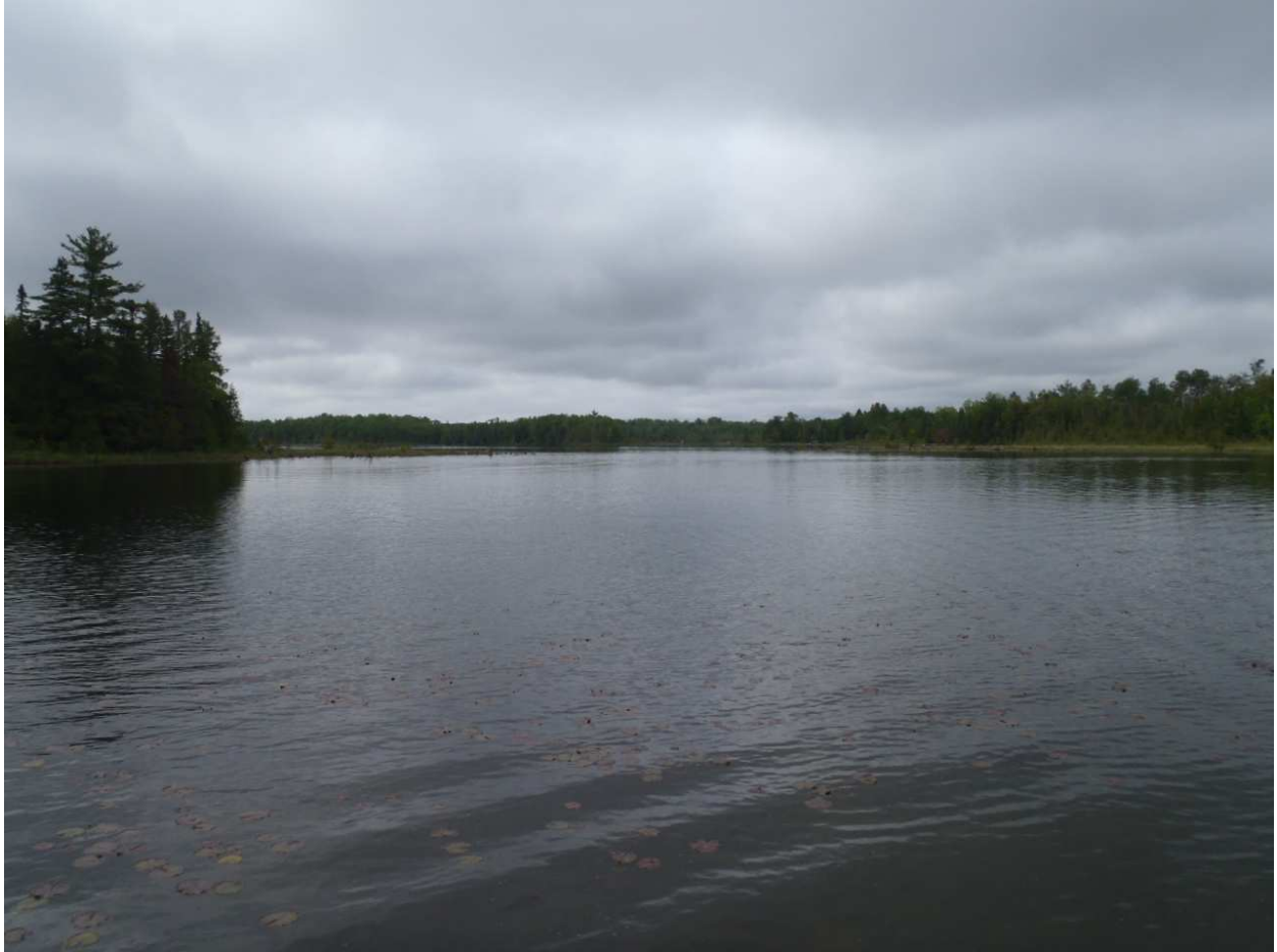
Photo 2. – Twin Lakes natural shoreline and floating in-lake aquatic vegetation.