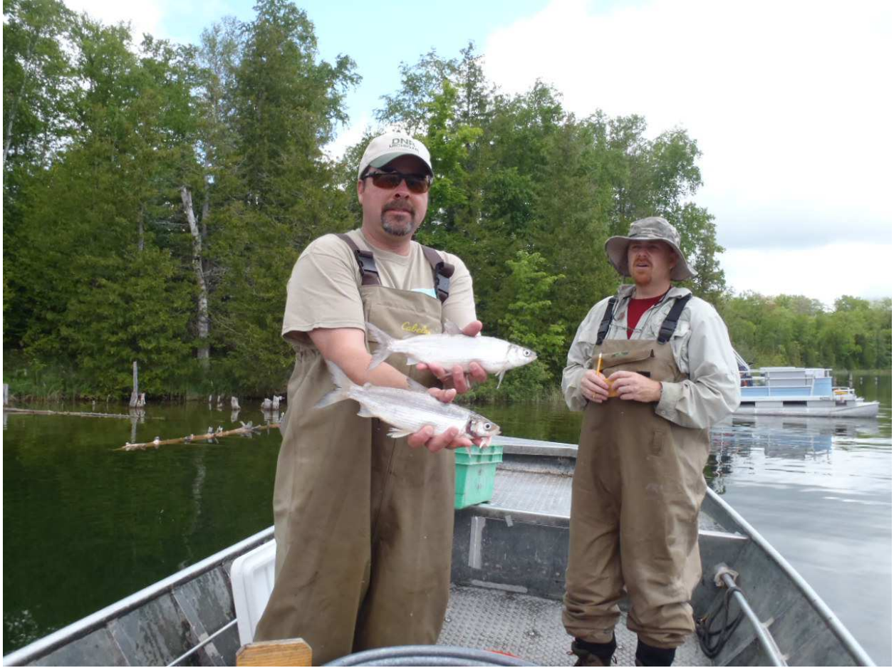
Photo 4. – Cisco, or lake herring, captured in nets during the 2013 fish survey.