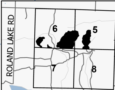
Locator Map 1:90,000