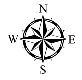
Locator Map 1:200,000