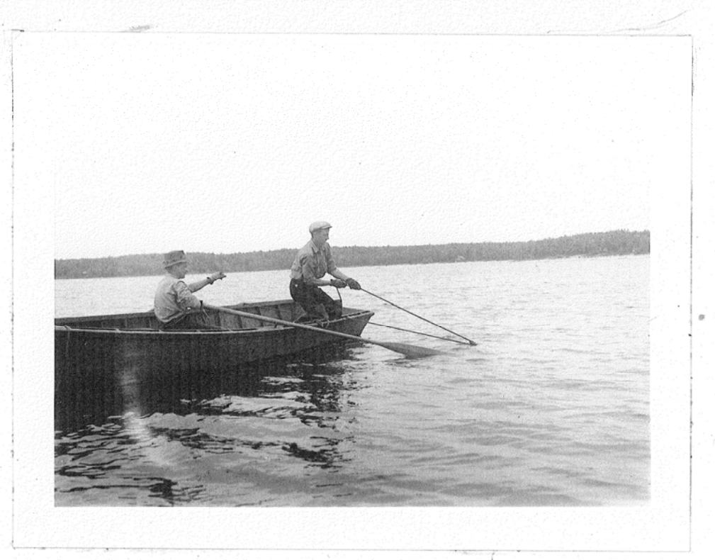
Fig. 4. Tightening the net.