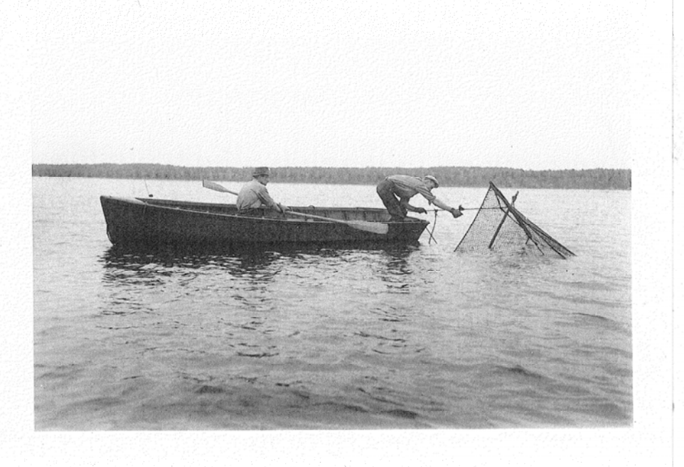
Fig. 3. Setting the pot or crib. Note spreader pole at back of crib.

Fig. 2. Setting the lead of a small trap net.