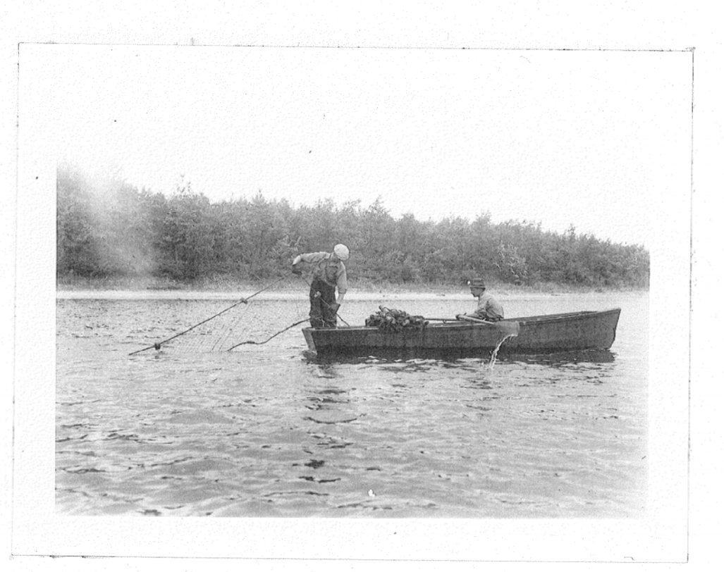
Fig. 2. Setting the lead of a small trap net.