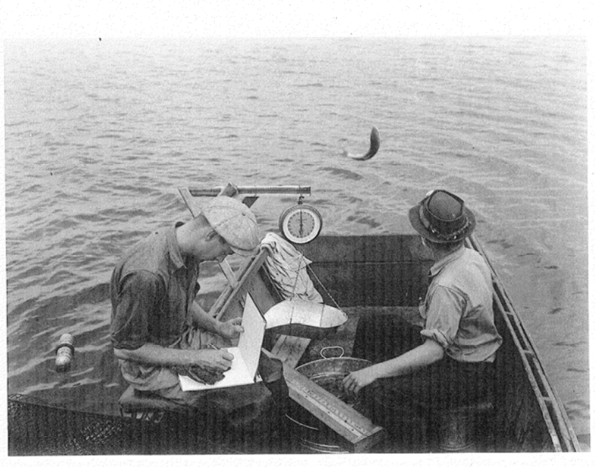
Fig. 9. Releasing a sucker.