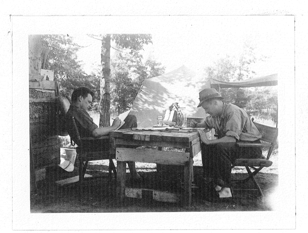
Fig. 10. Summarizing data in camp.