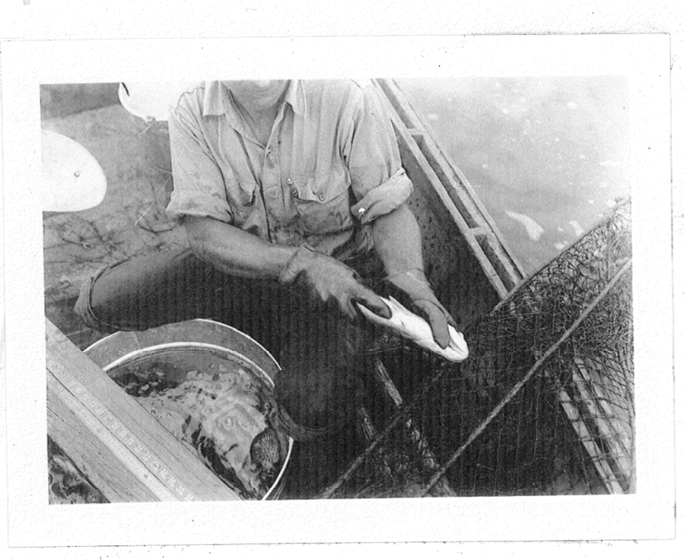
Fig. 6. A recovery. Note missing pelvic fin.