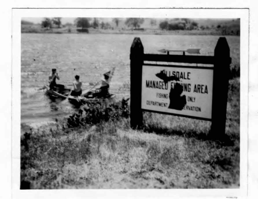
Figure 4.--Sign at the main entrance to the Hillsdale Managed Fishing Area. The anglers in the picture are just starting to fish on Pond No. 6.