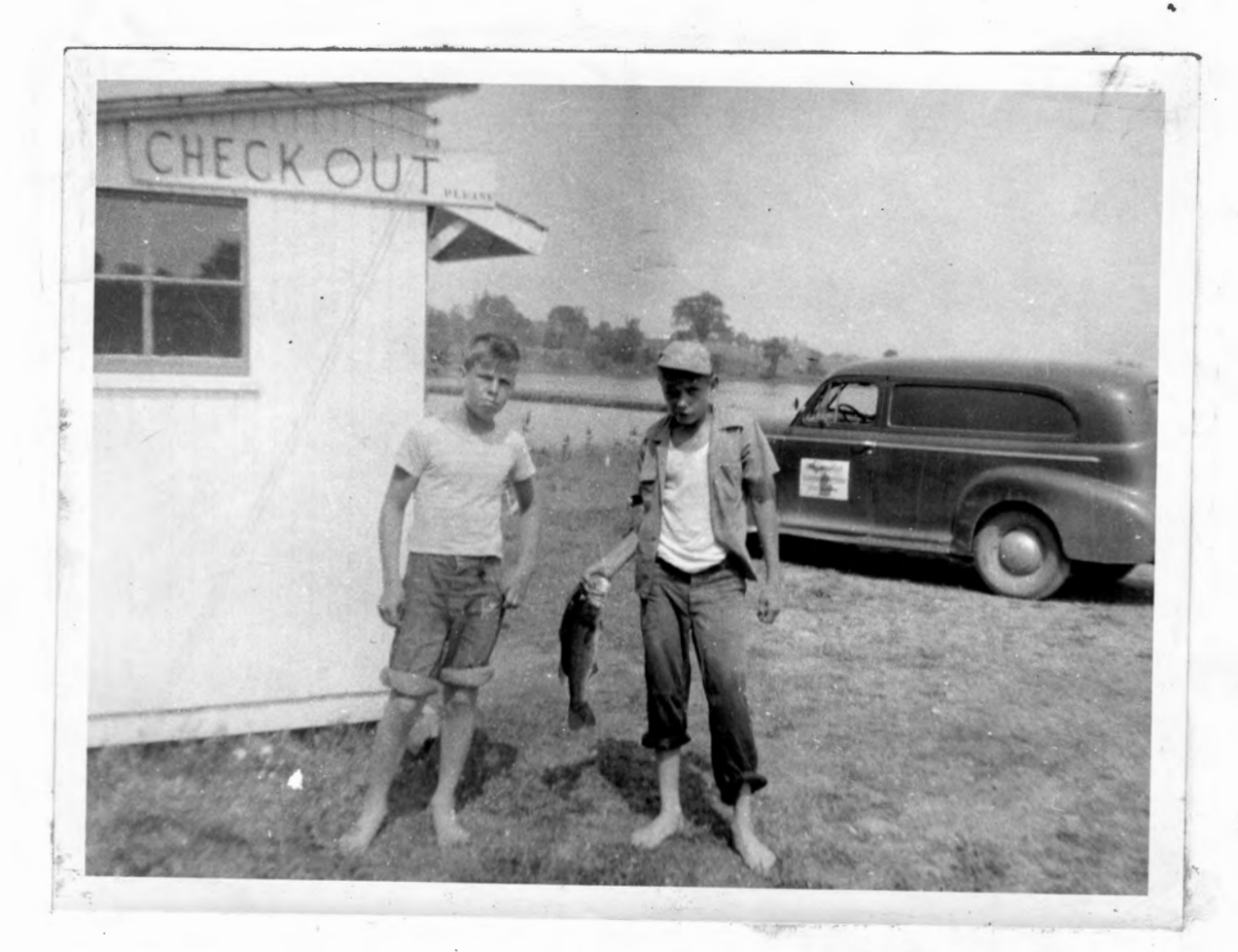
Figure 6.--The barefoot boy on the right caught this 20.5 inch, 4 pound largemouth bass while plug casting in Pond No. 6 at the Hillsdale Managed Fishing Area.