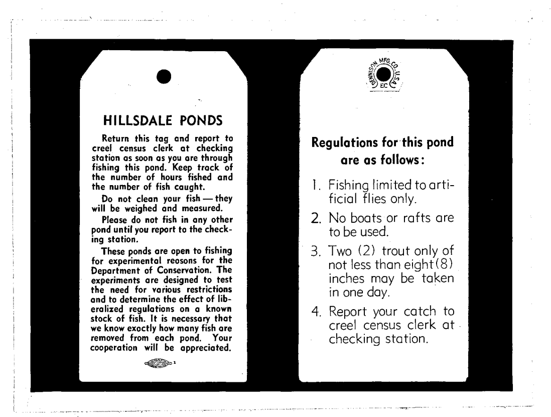
Figure 1.--Photograph of a tag (actual size) given to all anglers fishing Hillsdale Pond No. 2. Tags of different colors were given to anglers fishing on other ponds.