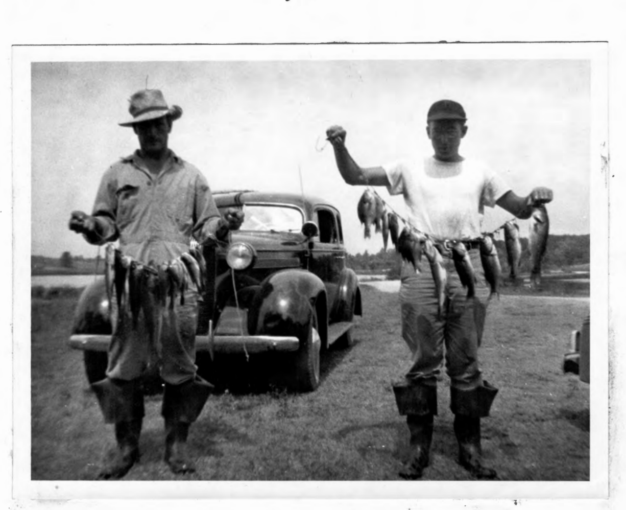
Figure 5.---Two Hillsdale residents display the fish they caught in pond No. 6 on August 6, 1946. The 10 largemouth bass weighed 9.7 pounds and the 13 bluegills 4.4 pounds.