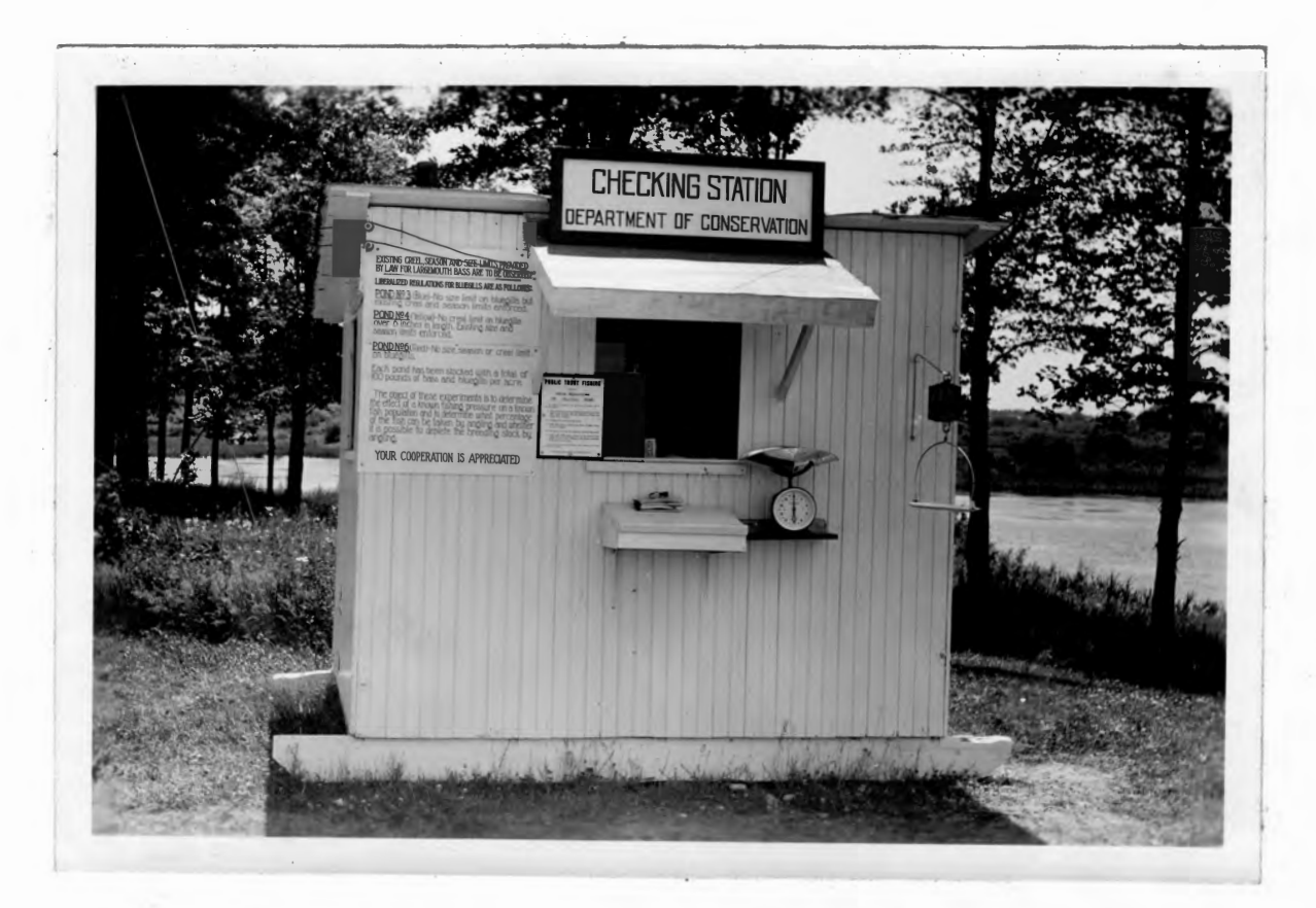
Figure 2.--Creel census checking station located at the Hillsdale Managed Fishing Area.