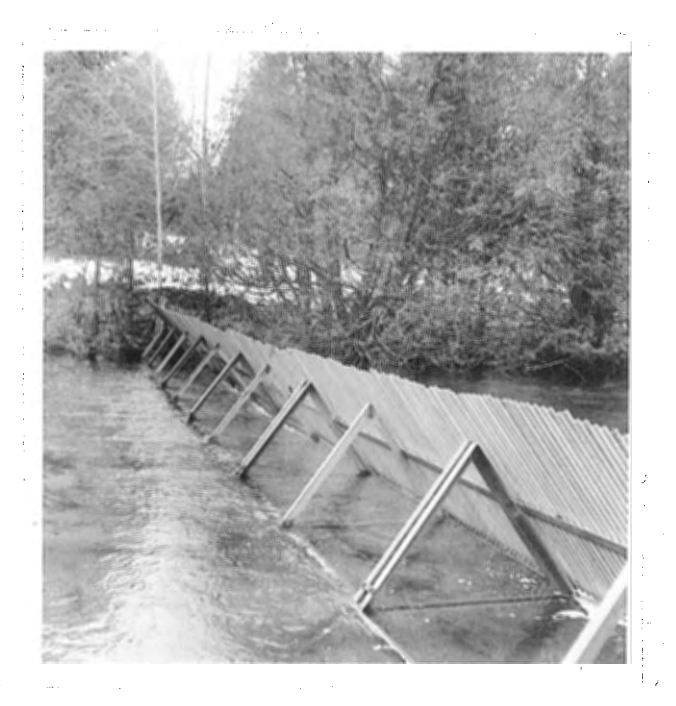
Figure 2.--The fish barrier located above Experimental Section I, showing the downstream side.