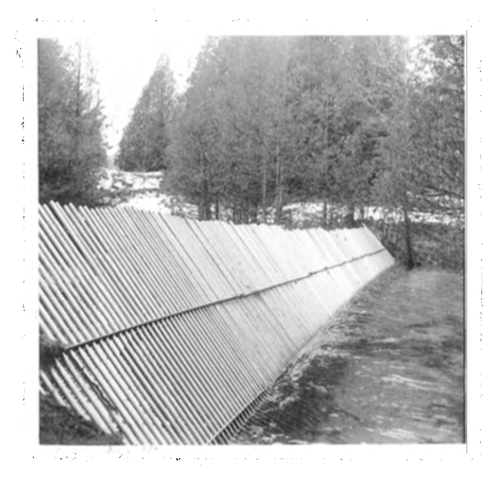
Figure 3. -- The fish barrier located above Experimental Section I, showing the upstream side.