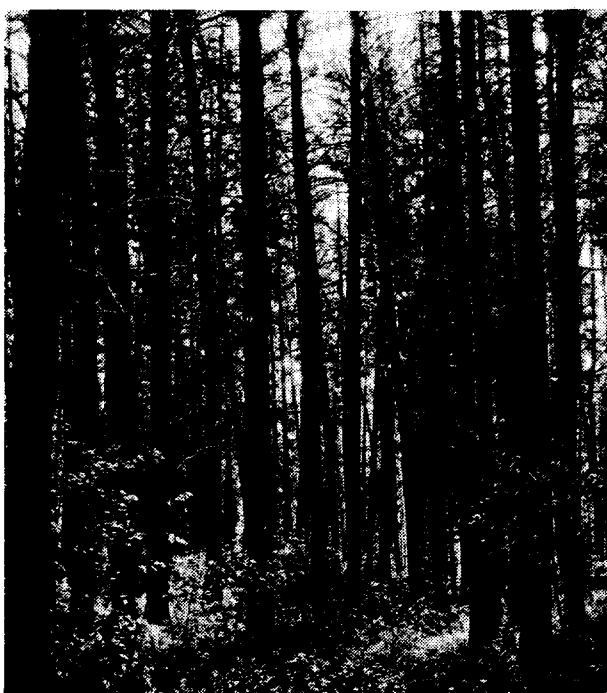
Figure 2. — This jack pine stand is about 50 years old and has reached the recommended rotation age for pulpwood, however another 20 years is recommended to produce poles and sawtimber.

Jack pine is a relatively short-lived species reaching maturity between 40 and 70 years (fig. 2). Mean annual growth in cords culminates earlier in high density stands than in low density stands (table 8, Appendix). Low density stands at older ages — 30 square feet of basal area per acre or less at age 40 and 60 square feet at age 50 — should be harvested and regenerated because they will not reach full stocking by age 70. Poor sites will not reach high basal area densities at young ages but some stands may be overstocked with numbers of trees per acre, thus requiring weeding or cleaning to avoid stagnation.