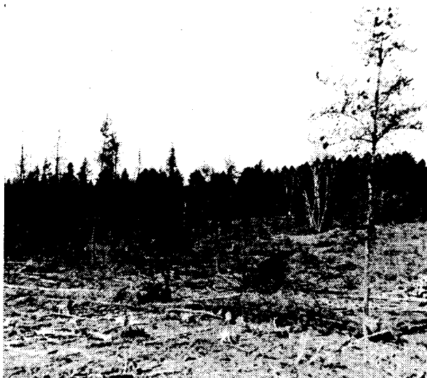
Figure 3. — Some kind of site preparation is usually needed after harvesting mature jack pine to dispose of slash, remove unwanted trees and shrubs, and expose mineral soil seedbeds.

Slash treatments include removing it from the area such as by pushing it aside with a bulldozer and by full-tree skidding, or modifying the slash on the area. Modifying the slash on the area includes prescribed burning, chipping, discing, chopping, and breaking it up with various types of drags. The method of slash treatment should be selected according to the results desired and to fit as many of the other site preparation needs of the area as possible.