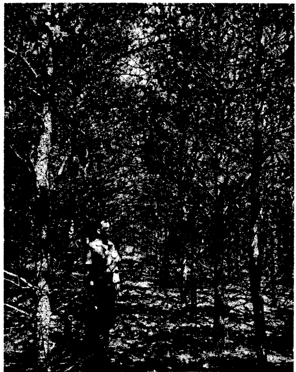
Figure 1. — Jack pine planted at 7 x 7 foot spacing produces a uniform stand at age 20 and will not require thinning for a pulpwood rotation of 40 to 50 years.

On the less productive sites or in stands managed for small roundwood products such as pulpwood, thinnings are not recommended (fig. 1).