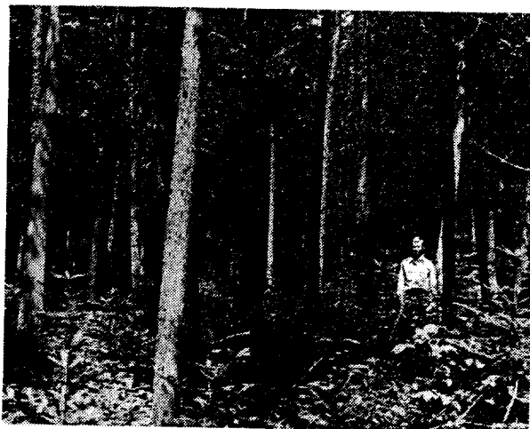
Figure 1. — Typical stand of northern white-cedar and some black spruce, with an undesirable undergrowth of balsam fir, 10 years after a second thinning to 130 square feet of basal area per acre.

The primary purpose of preparatory treatment is to control associated trees before the final harvest so that