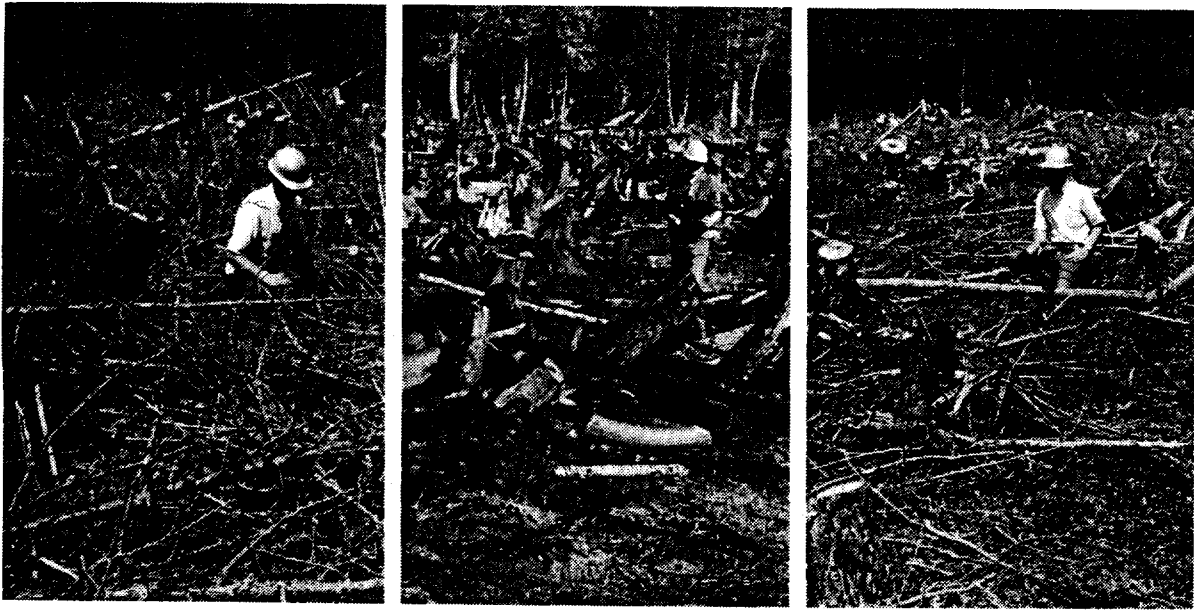
Figure 3. — Typical clearcut areas where slash of northern white-cedar (browsed) and associated conifers was: not disposed of, leaving a "heavy" cover (left); broadcast burned (center); and removed by full-tree skidding (right).

harvested by full-tree skidding, with branches and tops intact, apparently leave only a light cover of slash when felling and skidding are done with reasonable care (fig. 3, right). All trees should be felled as the harvesting progresses, leaving stumps as low as possible to minimize obstacles that would break off branches and tops during skidding. Also, the trees should be felled into the open rather than into the stand where more breakage would occur. If deer are in the vicinity, skidding of white-cedar and other browse species should be delayed a few days until the browse is eaten.