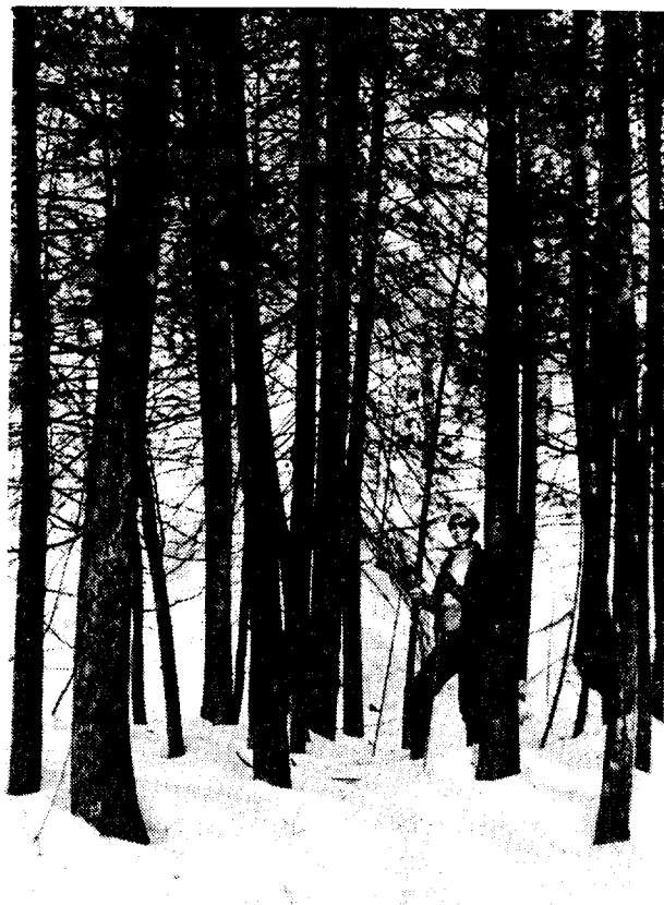
Figure 5. — The unusual bark and foliage patterns of northern white-cedar are esthetically appealing to many forest users, including hikers, snowshoers, and ski tourers.

The manager can minimize the impact of harvesting on the esthetic appeal (fig. 5) of the northern white-cedar type by: (1) having harvest boundaries follow natural site or forest type lines and (2) removing heavy slash cover and otherwise leaving harvest areas neat. Slash can be removed by full-tree skidding and burned at the landing, or broadcast burned in the case of wide clearcut