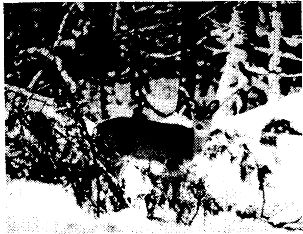
Figure 4. — This deer is browsing northern white-cedar slash near the edge of a clearcut patch. The dense stand in the background provides excellent shelter.

The main objective in small, isolated yards (less than 200 acres) should be to obtain and maintain a closed evergreen canopy for optimum deer shelter. Specific practices for achieving this objective are prescribed and discussed under "Intermediate Treatment" (p. 4).