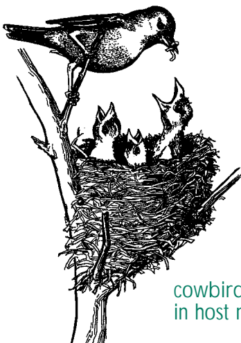
cowbird chick in host nest

The first step to managing edge is to identify any edges that already exist on your property. Then, you must decide if these edges can be improved. As you walk along the edge, determine if the transition between the two habitats is abrupt. Generally, the wider and more subtle and blended the edge is, the better it will be for wildlife habitat. You can therefore