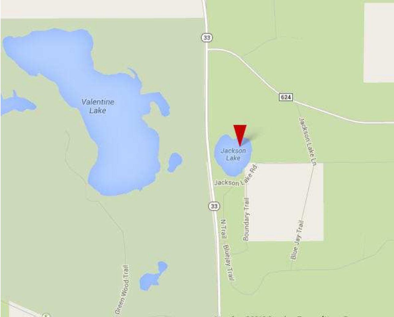
Figure 1. Jackson Lake and its nearby surroundings in Montmorency County.