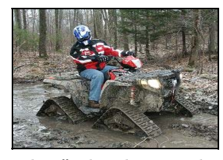
Riding off trails can damage natural resources and is prohibited.

It is important to note, too, that wetlands and riparian areas are protected in the state of Michigan and OHV's are prohibited in or upon the waters of any stream, river, bog, wetland, marsh or quagmire.